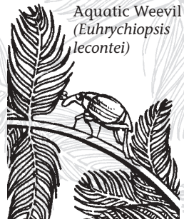
Aquatic Weevil ( Euhrychiopsis lecontei )

Early detection of EWM growth is critical in stopping the plant from becoming a widespread problem. The best chance to halt these non-native invaders is when they first appear on the scene.