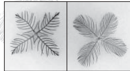
Northern water-milfoil ( Myriophyllum sibiricum )