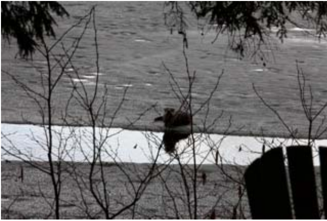
The otter sits atop the melting ice just before ice-out. Thanks, Tim Tully for this glimpse!