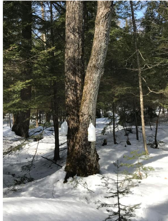
Maple sap is running early this spring. Photo from March 6 th 2021 on Twin Pines Lane on the east side of Diamond Lake.