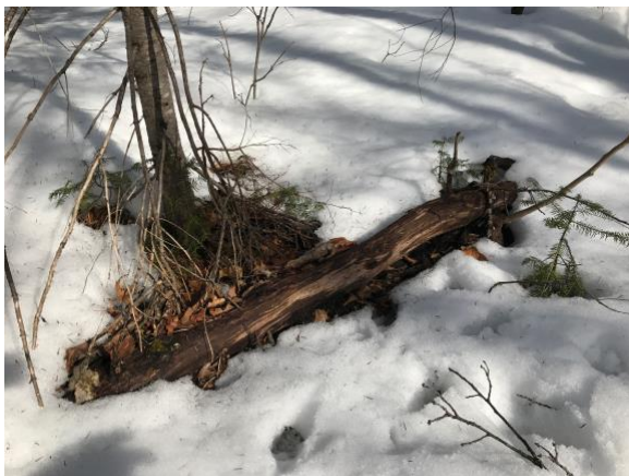
K-9 tracks near a log emerging from the winter snow.