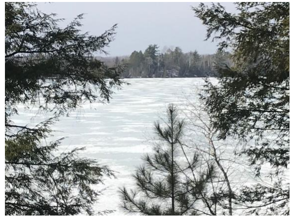
Diamond Lake slush ponds from snow melt, March 9, 2021

As a part of our Bylaws revisions and updated Articles of Incorporation we approved last fall, we applied for recognition from the IRS as a public charity and exempt from federal tax regulations under IRC Section 501(c)(3). That status has now been granted. Henceforth all donations, dues, bequests, and gifts to Diamond Lakers are exempt from tax (yay!). I will send along a reminder when we begin collecting dues for 2021. This is good news not only for the (small) potential tax advantage for members, but it will be helpful in fundraising in the future when we may be seeking larger amounts, land set-asides or other kinds of charitable contributions. Thanks to Board member Dave James for heading us down this road. A similar exemption from the state of Wisconsin is now pending approval.