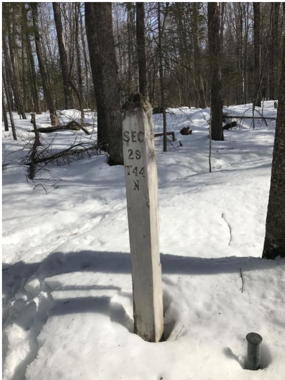
An old Public Land Survey System township corner marker alongside a modern National Geodetic Control marker near the crest of the Laurentide divide just east of Diamond Lake.