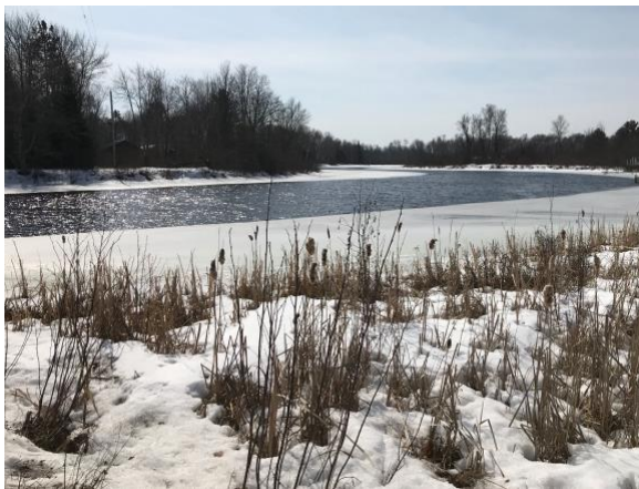
Namakagon Lake outlet near the Birch Point Road bridge, March 2021